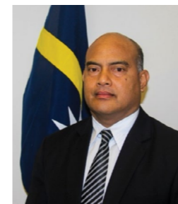
H.E. Hon. David W.R. Adeang, M.P President Republic of Nauru

We look forward to welcoming you as a citizen of Nauru, a small island nation with a large vision for climate action and global cooperation.